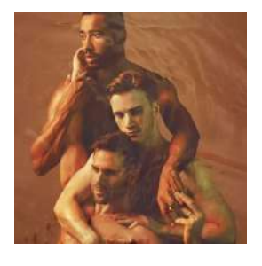
Afterglow | 10 February 2024

In partnership with AfroQueer Studios, we bring you a curated panel of queer storytellers from both white and global majority LGBTQ+communities to tell their histories and stories. Register here.