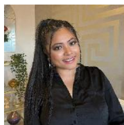
Apple Cueto Global Events Lead